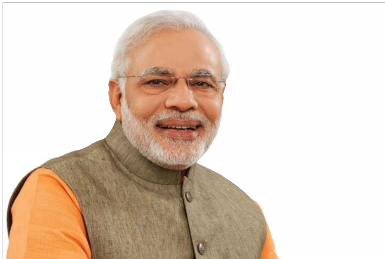
Hon'ble Prime Minister of India, Shri Narendra Modi