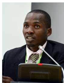
Arnest Sebbumba Countryside Youth Foundation, Uganda