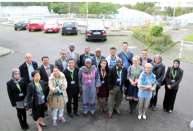
Participants during the study tour in BIBB

BIBB conducts research on initial and continuing TVET and its progressive development. A presentation was given on the institute's role within the German TVET system, the dual training system itself and the training regulations for selected green job profiles. This theoretical introduction to the German training system and how the concept of sustainable development is progressively translated into green jobs, was combined with a visit to a water treatment plant where the participants had the opportunity to speak to apprentices and learn about the water treatment and filtration processes.