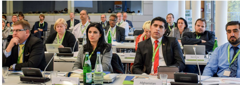
Participants during the session

Across every region, the UNEVOC Network has made progress in using TVET to address the challenges identified during the Shanghai Congress. PP presented at the fora provided an indication of the kinds of forward-looking measure that countries in each region have implemented to strengthen TVET's role in promoting youth employability and SD. All regions have made strides to improve their evidence base and their practices regarding identifying, delivering and assessing competences for green jobs. However, the fora also reported a number of common challenges. These include a widespread negative perception of TVET, inadequate funding and a lack of well-trained teachers and trainers. While some countries have made significant progress in anticipating the transformative possibilities for TVET, others lag behind. For these, structures such as the UNEVOC Network offer real opportunities to accelerate their responses.