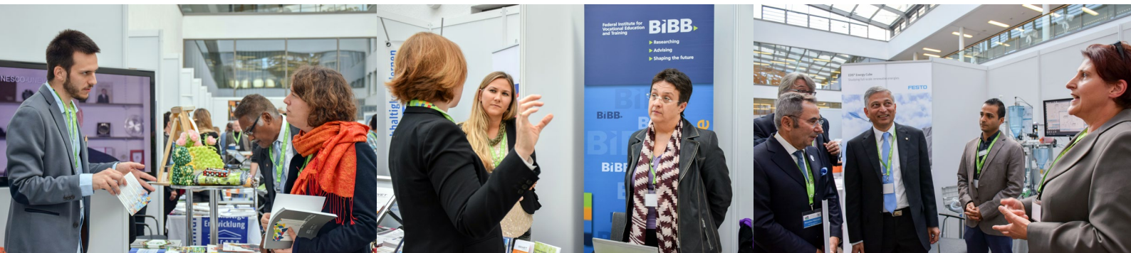
Global Forum exhibition

This report documents the discussions for further informing the global debate on TVET and the post-2015 agenda. It describes the approach in which the forum utilized cross-regional networking and partnership as platforms to create synergy and make TVET contributions relevant to the fulfilment of the aims of the post-2015 education agenda and its implications for the SDGs.