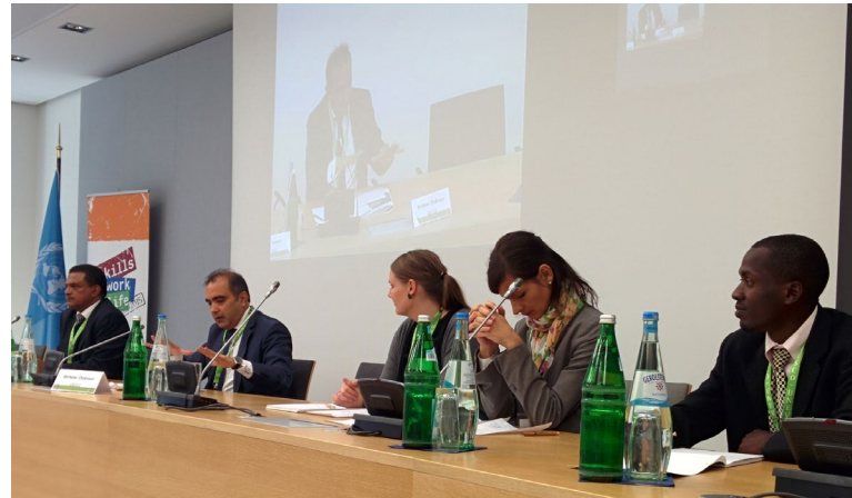
Panelist with youth representatives from Germany and Uganda

stakeholders. To achieve this, the quality and relevance of courses must be strengthened and improved. Mr Samuels argued that people will not look favourably on TVET institutions if their quality is not good or if they do not provide skills that make people effective in the labour force.