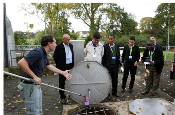
Study visit in DWA