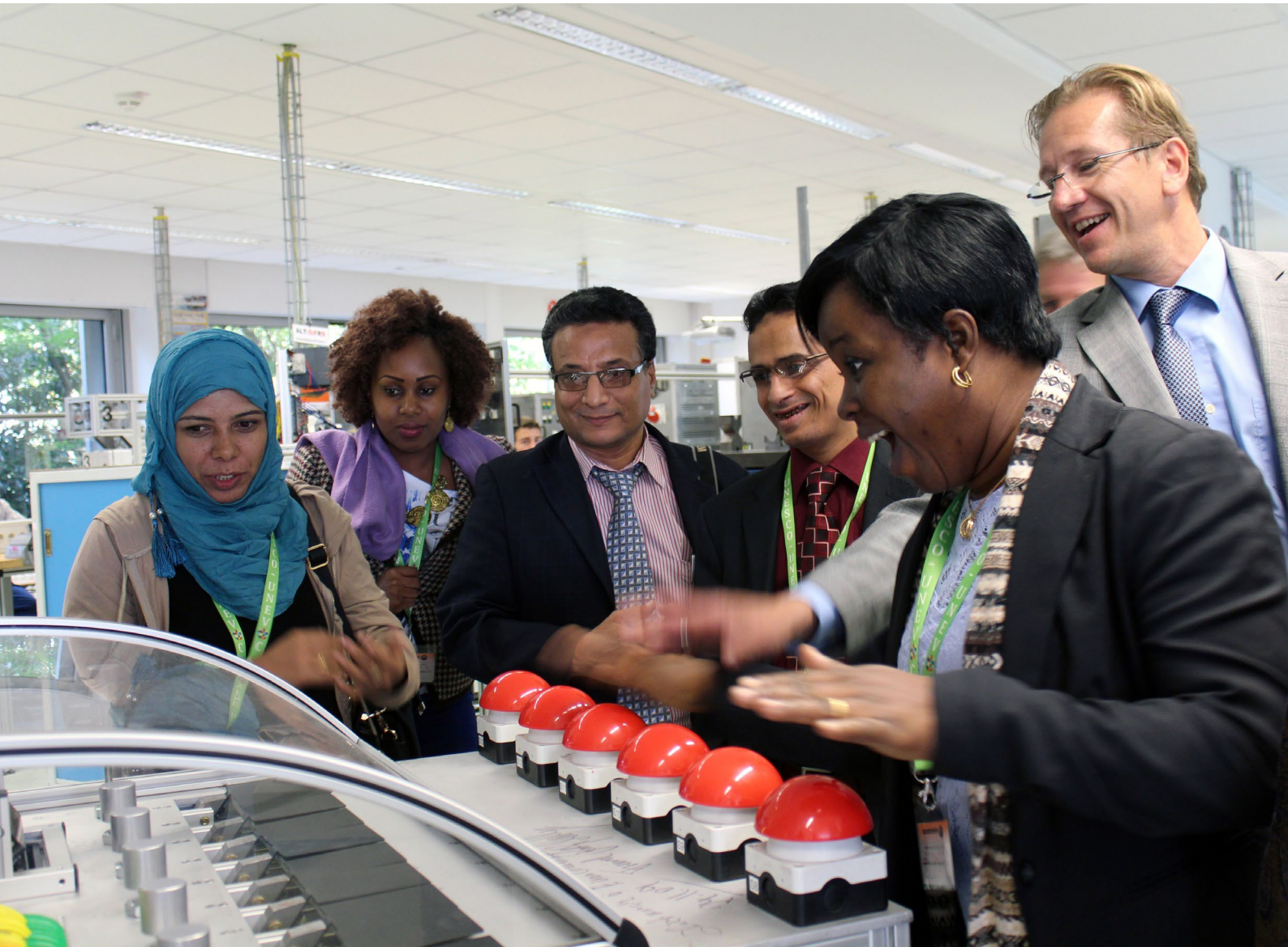
Delegates during one of the study tours