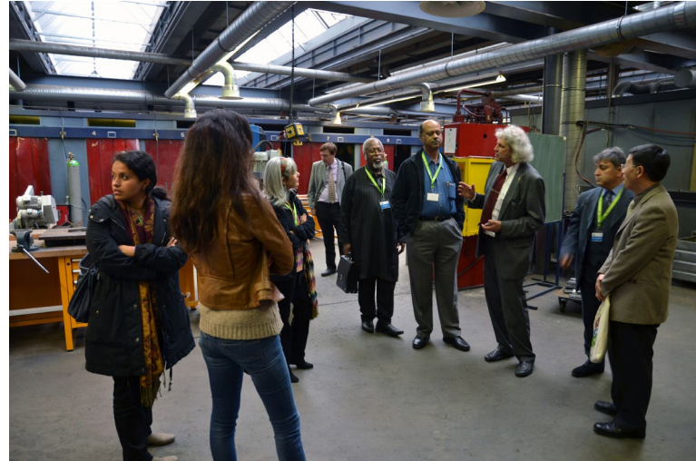
Participants during study visit

agenda. The Sustainable Development Goals (SDGs) underpinned multidisciplinary discussions at the forum and represented an important step forward in development thinking by bringing together sustainable development with poverty alleviation, inequality and technological change in a holistic account of how people's lives can be enhanced.