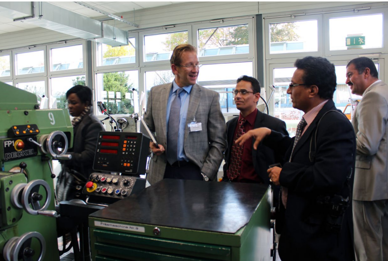
Study visit in Currenta