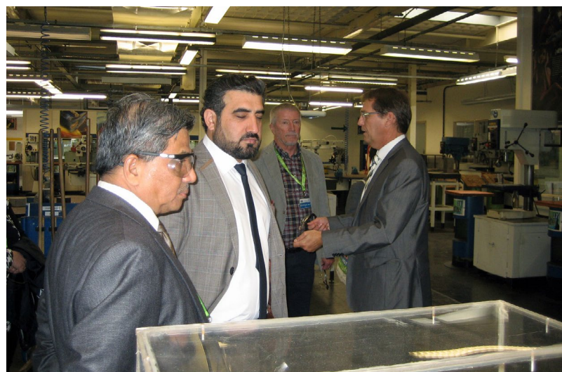
Study visit in Ford Ford Aus- und Weiterbildung e.V.

Besides a comprehensive introduction to the German dual training system and FAW's role in providing in-company training, a special emphasis was given to the company's programme targeting vulnerable youths and its campaigns to attract female apprentices for jobs that are traditionally dominated by men.