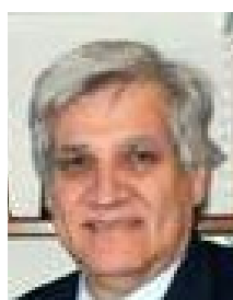
Juan Carlos Villagrán de León Head, United Nations Platform for Space-based Information for Disaster Management and Emergency Response UN- SPIDER, United Nations Office for Outer Space Affairs (UNOOSA)