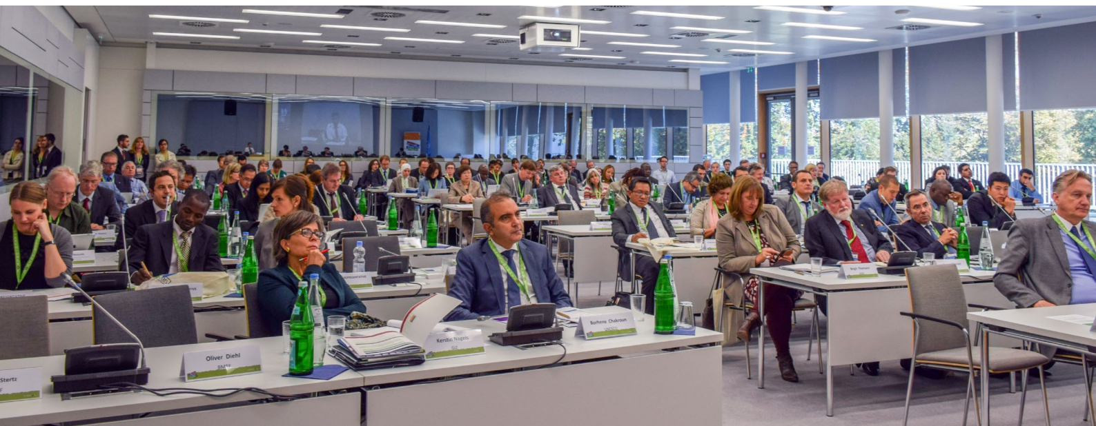
Participants of the Global Forum