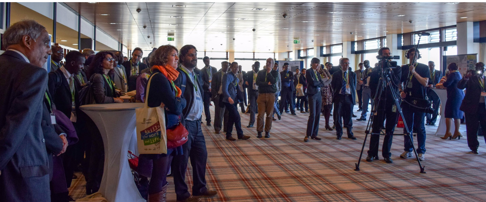
Participants during the UNEVOC Network Session