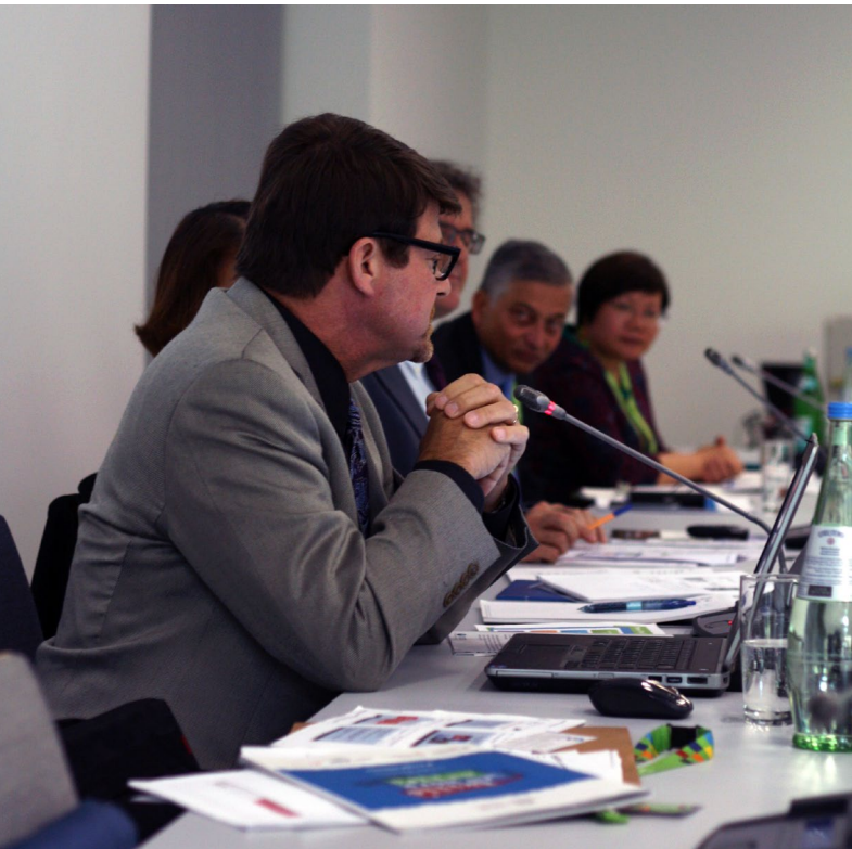
Panelists of the session

Greening TVET is part of a transformative and inclusive vision for TVET as outlined at Shanghai. It represents a more systemic approach to all TVET activities than a mere economic approach. It aligns with local economies, covering both formal and informal enterprises and work. It guides stakeholders in the framing of skills development according to available occupational requirements, addressing questions of what skills and workforce education programmes are needed; what proficiency levels should be set for what jobs and work processes; and what qualifications should be the focus of investments. Thus, it symbolizes a continuous process towards attaining low-carbon green growth.