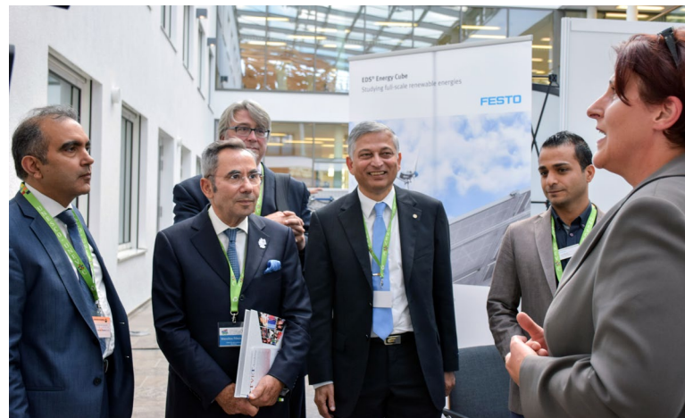
During the exhibition opening