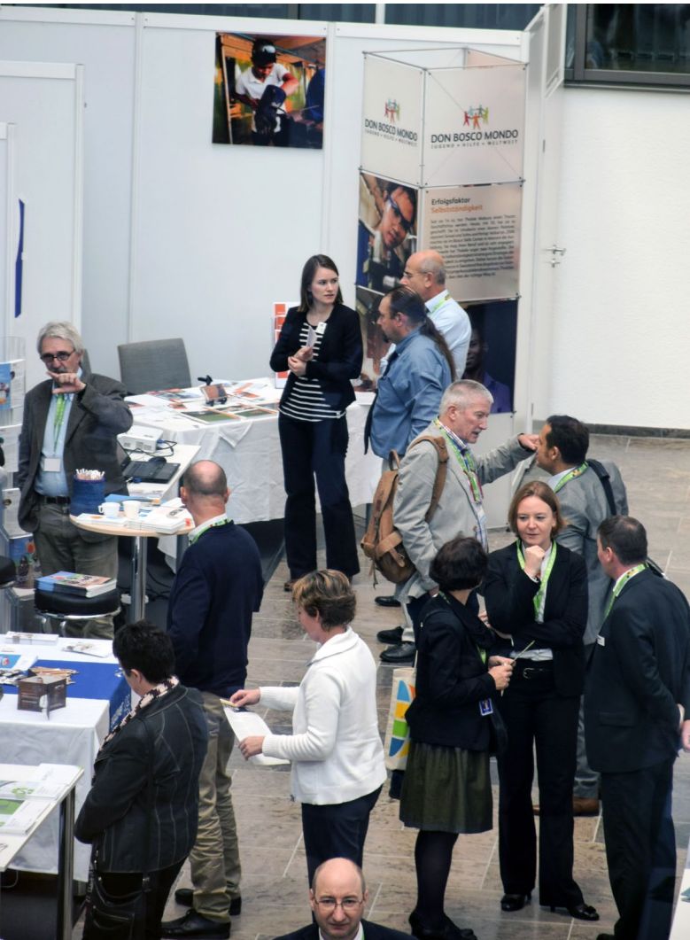
Participants visiting exhibition booths