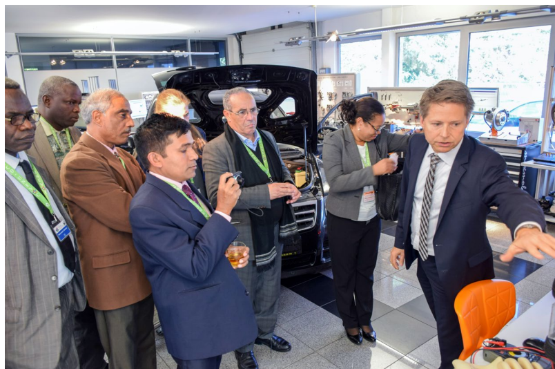
Study visit in Lucas Nülle

'We are trying to make the technology visible for the student – we have to be able to adapt our products so we can make sure we are prepared for the technology of tomorrow', said a LN representative.