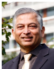
Shyamal Majumdar Head, UNESCO- UNEVOC International Centre for Technical and Vocational Education and Training