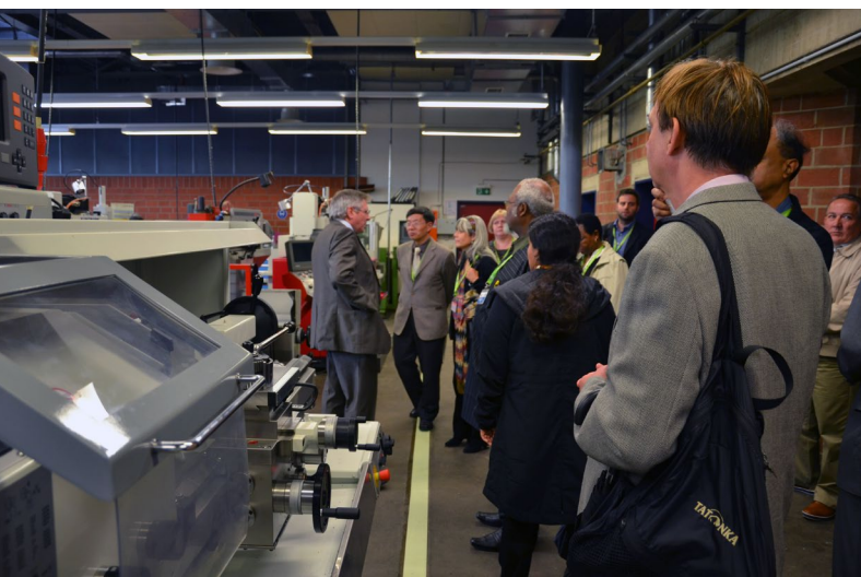
Study visit in Icon Institute

The tour continued with a visit to a training centre (BGE) managed by the Chamber of Crafts and Trade Aachen. The institution offers courses certified with the German Meister degree (equivalent to a Bachelor degree) and other specialized training courses.