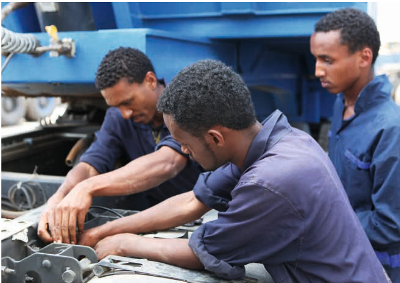
Photo 1: Students from the Heavy Duty and Commercial Vehicles Academy take part in an internship at a local Volvo Garage in Ethiopia

The project needs to be in line with national development policies. Donors want policy makers engaged and want the local level work at the VTCs to be anchored and focused on systemic change at the national level. The donor appreciates shared learning about policy-making by drawing comparisons from different regions, and they request global communication of the PPDP learning in the public domain. The donor's ultimate objective is to achieve as much systemic change as possible.