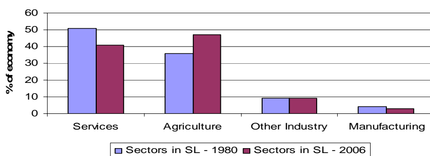
Figure 1. Sectoral shifts in Sierra Leone - 1980 to 2006

However, despite the abundance of natural resources, including minerals, agriculture and fisheries, the economy remains dominated by production of cash crops and services. See Figure 1.