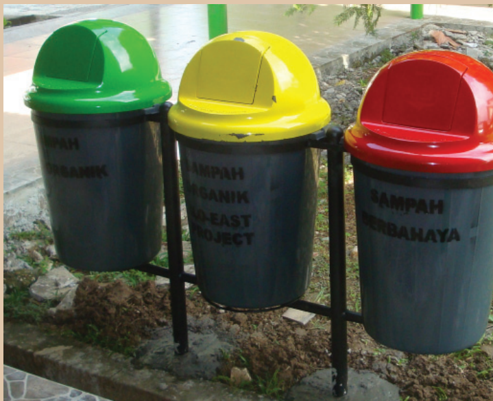
As part of the waste management programme, segregated rubbish bins were set up at various points on the BLKI campus.