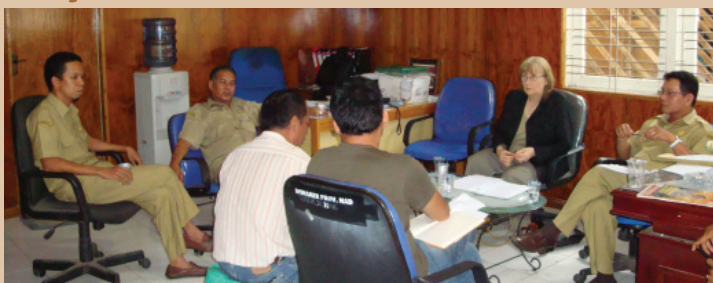
Routine coordination meeting on all common issues are held with the provincial manpower office.

The role of the BLKI within the province needed to be asserted within formal and informal communication channels. In particular, building trust with the private sector was and continues to be a priority. The following major stakeholders were identified: