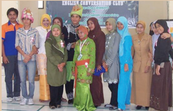
ECC Participants in Traditional Clothing

Forming an English Conversation Club (ECC) proved to be an effective means of raising the self-confidence, responsibility and enthusiasm of the trainees. At the same time, instructors and staff members used the ECC to improve their facilitating skills and demonstrate their commitment to develop the trainees' skills in a holistic way. The ECC increased student involvement and contributed to making the BLKI a more open, attractive and diverse place of learning.