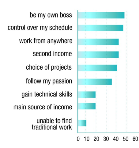
FIGURE 1. WHY WORK IN THE PLATFORM ECONOMY?

motely (<sup>3</sup>). Quite a few could potentially be taken over by a gig workforce.